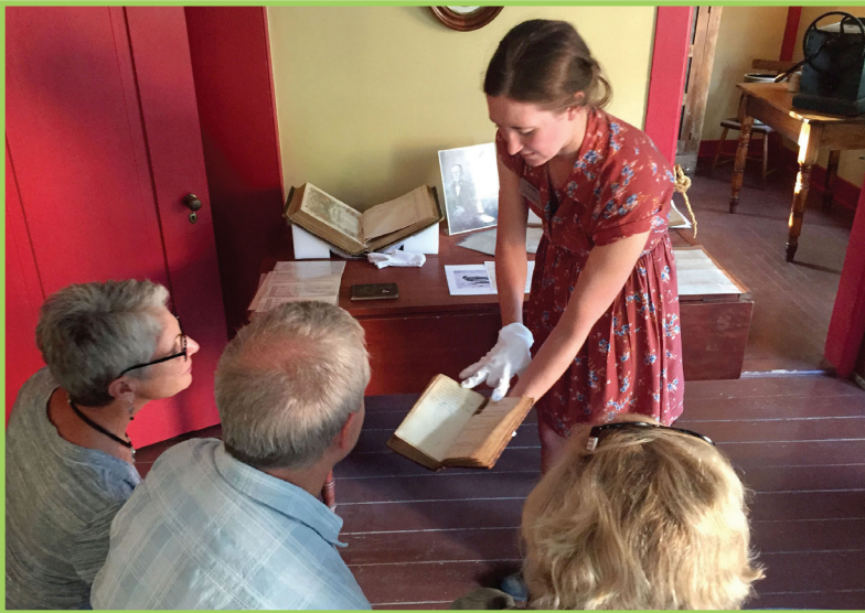
Presenters combine artifacts and images in historic setting to bring history to life

History comes to life at the Village with radio shows, tours, café chats, and more!