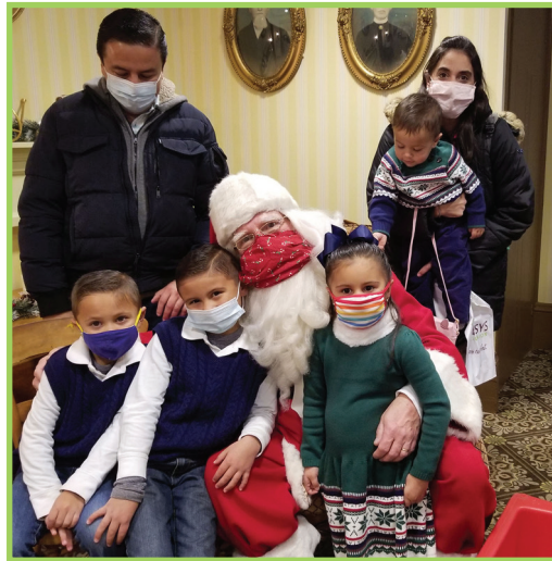
Santa Claus brings holiday cheer to the Village each year