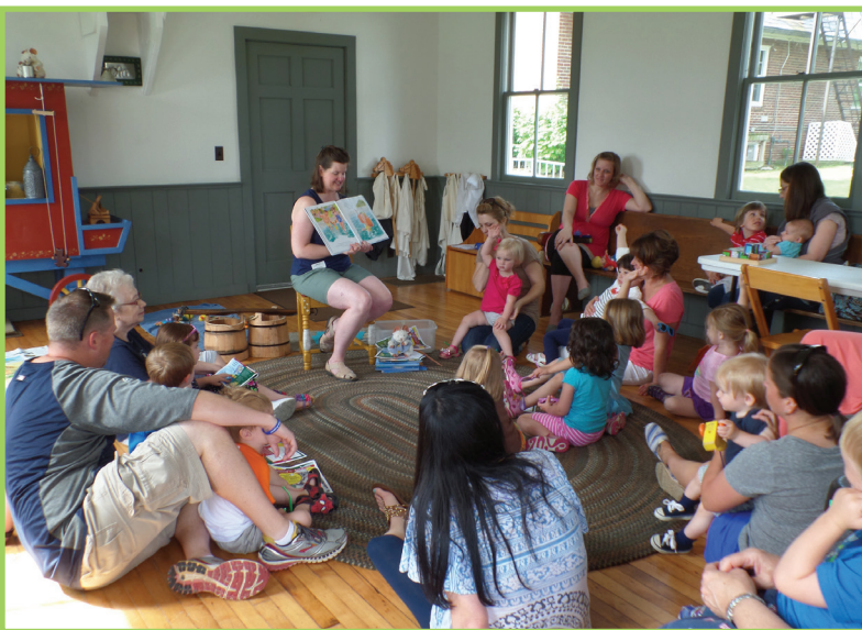
Cheddar the Mouse shares stories and artifacts with little historians

History comes to life at the Village with radio shows, tours, café chats, and more!