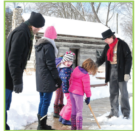
Mid-Winter Open House

Signature events, holiday programs, and seasonal open houses offer fun for the whole community!