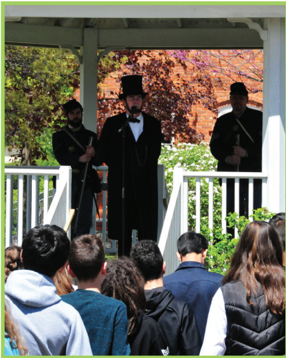
Our Civil War Days event is immersive and memorable