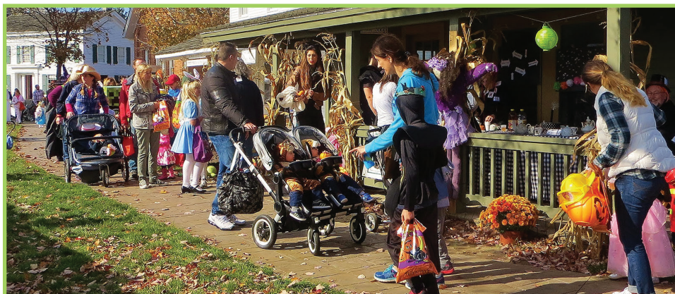
Families enjoy our annual Trick-or-Treat event

Signature events, holiday programs, and seasonal open houses offer fun for the whole community!