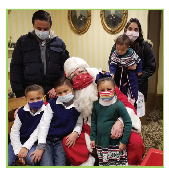
Santa Claus brings holiday cheer to the Village each year