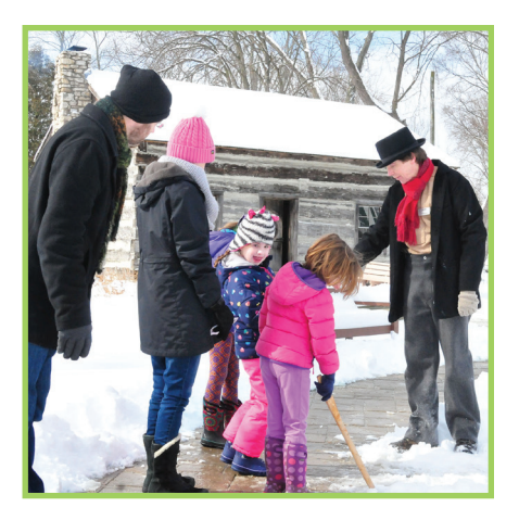
Mid-Winter Open House